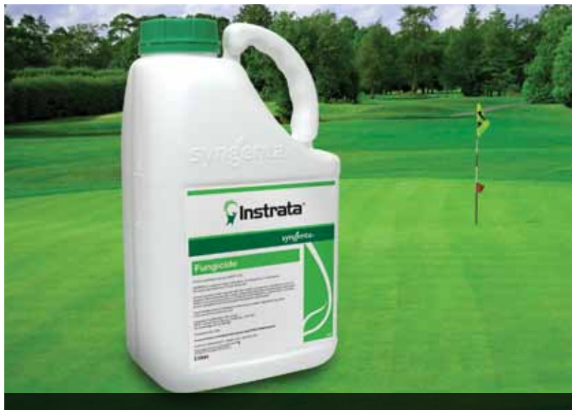
Instrata is the fast-acting turf fungicide for all seasons. Three actives and three-way action makes Instrata the one-product solution for turf disease control.